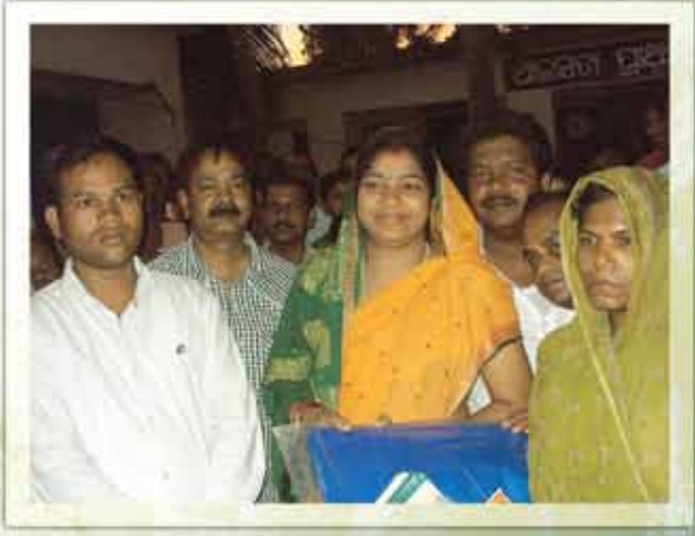
Relief distribution to cyclone effect villagers of Saud, Bahanaga, Balasore